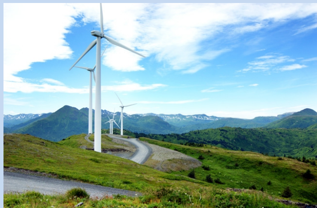
Kodiak Island in southern Alaska is powered 99.7 percent by hydro and wind.

As most Alaskans can attest, energy in The Last Frontier is expensive. The average residential electricity rate of more than 18 cents per kWh is a full 50 percent higher than the national average, ranking among the highest in the country. That's in part because outside the 50 hydro plants throughout the state, most of Alaska's rural communities rely on imported diesel for their electricity. But the folks of Kodiak Island (pop. 15,000) in southern Alaska—powered almost 100 percent with renewable energy—have a different story to tell.