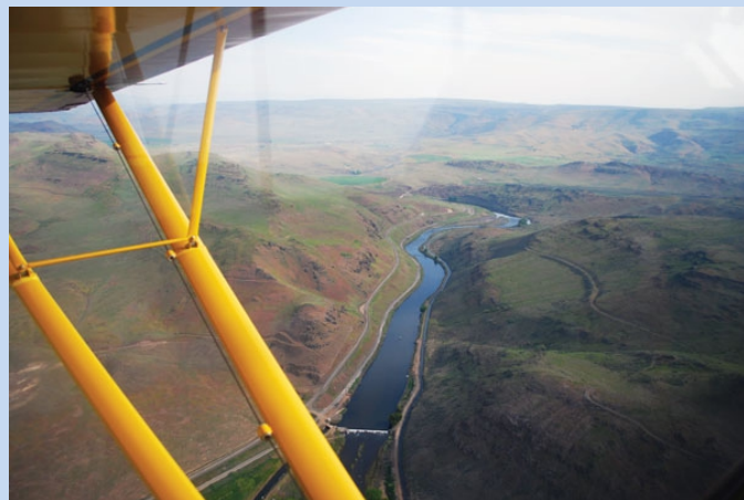
From Paul Collins' small airplane, one can see where the Idaho Water Resource Board proposes to build a 283-foot earthen dam on the Weiser River. Everything beyond the mouth of the canyon would be flooded.

Collins' attitude suddenly changes. "It's so stupid," he says. "The whole idea of it. We're going to lose all this. I thought we won this fight 25 years ago, but I guess you can never know for sure." Back in the mid-'90s, Collins was part of a group that turned the railroad bed along the Weiser River into a trail—the project became known as the Friends of the Weiser River Trail. That trail is in jeopardy of being 250 feet underwater due to a proposal from the Idaho Water Resource Board to build a 283-foot dam just a few miles upstream of Weiser. The dam would hold 750,000 acre feet of water, almost as much as Lucky Peak, Arrowrock and the Anderson Ranch reservoirs put