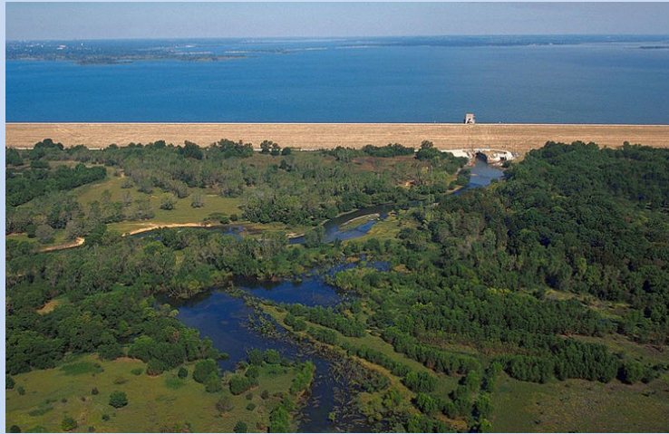
Lake Lewisville's dam looks so ... intact from up here. It's not, and it has company across the United States. U.S. Army Corps of Engineers

You can probably trust the U.S. Army Corps of Engineers on this one. The dam holding back Lake Lewisville probably isn't going to fail in the immediate future. The 180 billion or so gallons of water it holds back probably won't burst free and wash away the half-million people in its path. The recent appearance of a sand boil, which indicates that water has seeped under and potentially weakened the dam, and the portion of the barrier that sloughed off into the lake — a "slide," as they call it — are admittedly worrisome. It's not unreasonable to suspect that the Corps might be massaging the actual risk level to tamp down fears of catastrophe. But it also seems likely that the local and federal government learned something from Hurricane Katrina and would warn people of imminent cataclysm.