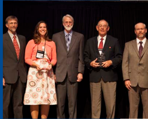
City of Greensboro, Schnabel Engineering, and Crowder Construction as they accept the ASDSO Award.

The City of Greensboro Water Department is to be commended for its consistent quality leadership. All parties to the project were positively engaged and became voices to be heard and allies to be supported as agents of purpose and achievement. This success story concludes with the expedited completion of an award winning design delivered at a very favorable cost by a constructor dedicated to delivering quality materials and exceptional workmanship on time.