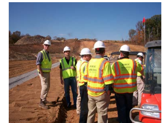
In planning for their own water supply reservoir, Henrico County, Virginia, officials visit the Rocky Pen Run Dam with Stafford County and Schnabel personnel.